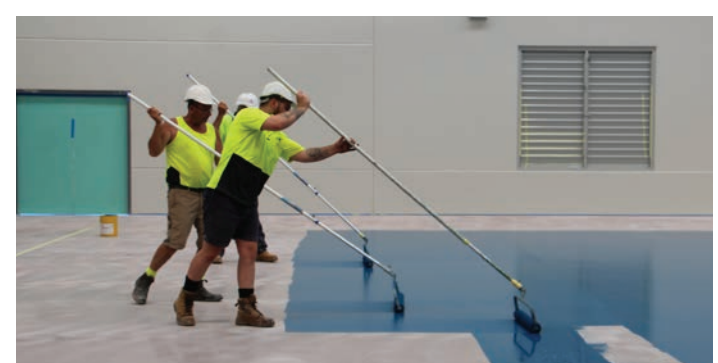
ABOVE: The specialised flooring being applied inside the Sports Dome in late December 2018

The sixth project update will be issued in about July 2019. If you would like to receive one, please email trc@tamworth.nsw.gov.au and ask to be added to our Centre of Sporting Excellence distribution list. For all other enquiries, please do not hesitate to contact me on 6767 5003