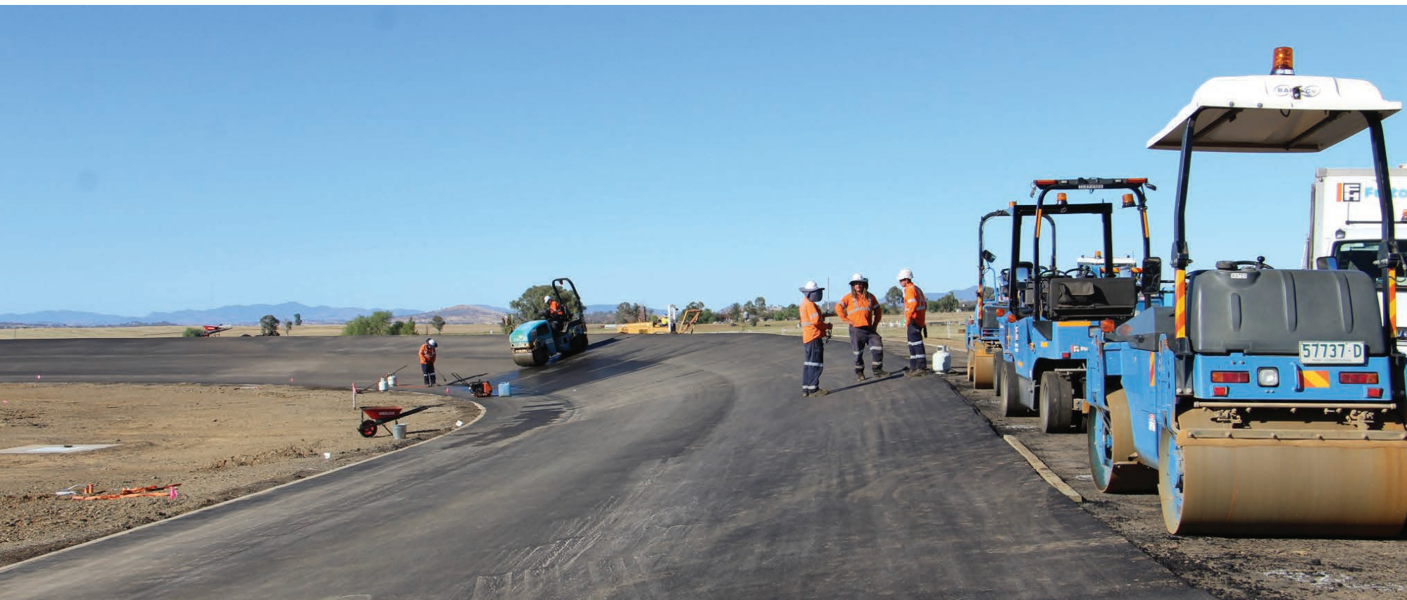
ABOVE: Asphalting nearing completion at the velodrome.