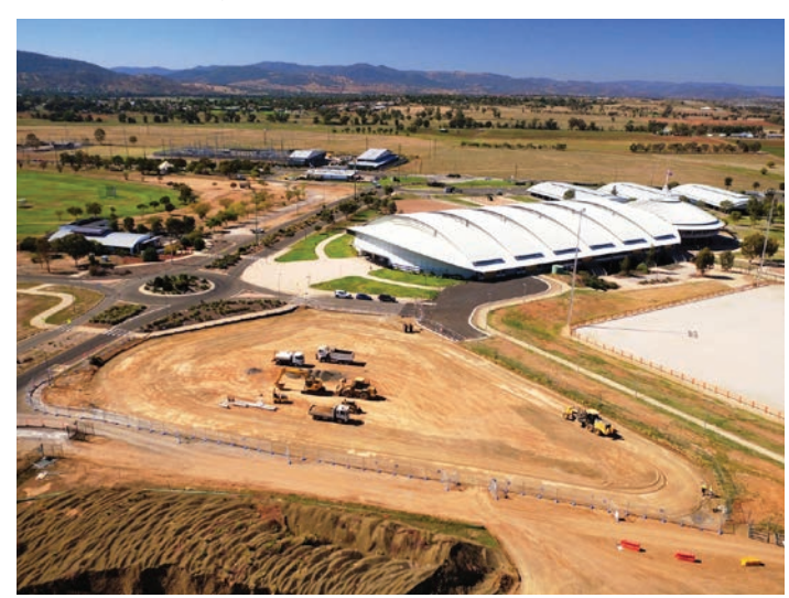
ABOVE: Construction underway on the new AELEC car park.